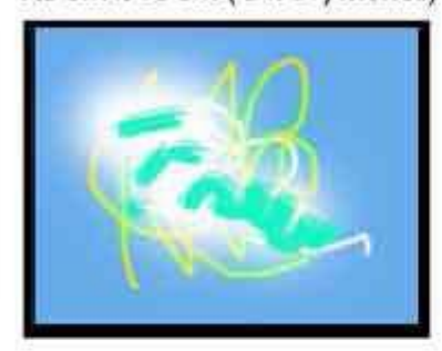
7.5 cm x 10 cm ( 3 x 4 "/inches)